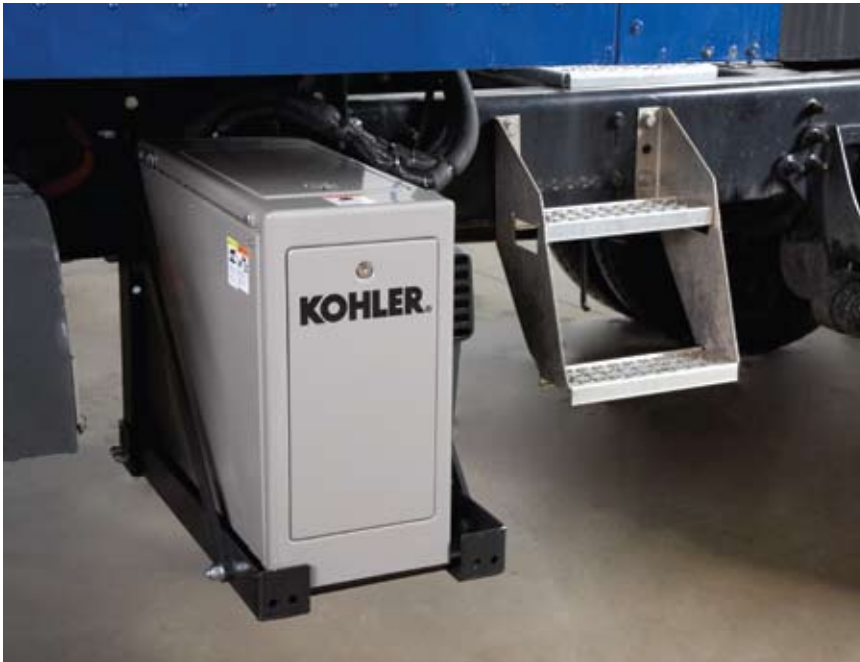
3APU Power Unit Installed