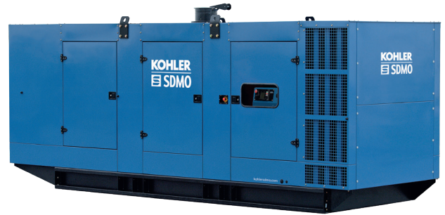
B900 - SOUNDPROOFED VERSION

The B900 - B1500 generators provide an optimized solution for standby applications. The easy and quick-to-install products meet requirements for reliability while streamlining costs.