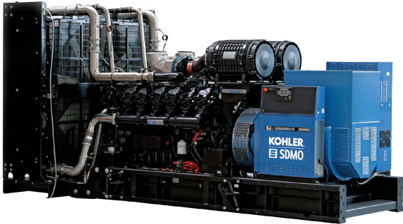
B1400 - OPEN VERSION